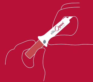
1 Score ampoule lightly with about 1/4 turn of CLIC-OPEN