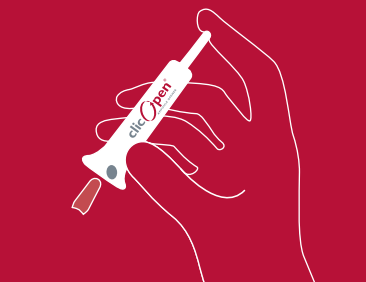
3 Eject head of ampoule